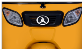
STYLISH & SPORTY TWIN HEADLIGHTS