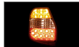
TRENDY & BRIGHT LED TAIL LIGHTS