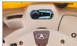
ATTRACTIVE & MAJESTIC BEIGE DASHBOARD