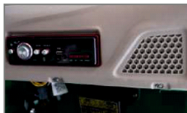
BEST IN SEGMENT MUSIC SYSTEM