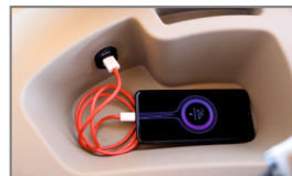
USB PORT FOR CHARGING ON-THE-GO