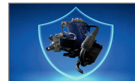
IMPROVED AIR-CIRCULATION SUPER COOLING BLUE ENGINE