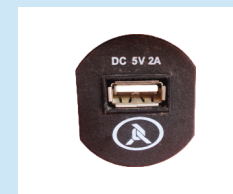
Charge On Go