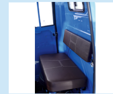
Comfort Seating for Driver