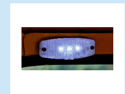
LED Cabin Lamp