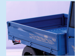
Best in class cargo space