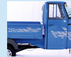
Stylish body graphics