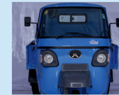
Multi Focal Head Lamp with Halogen Bulb