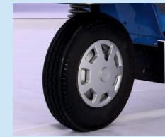
Front & rear wheel caps