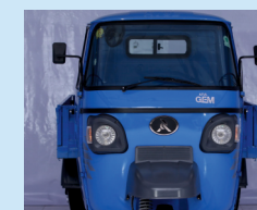
Multi Focal Head Lamp with Halogen Bulb