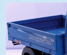
Best in class cargo space