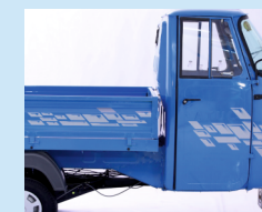
Stylish body graphics