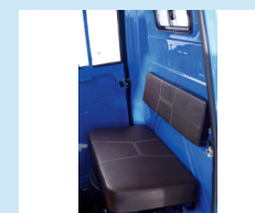
Comfort Seating for Driver