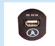
Charge On Go