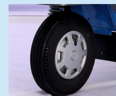
Front & rear wheel caps