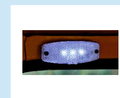
LED Cabin Lamp