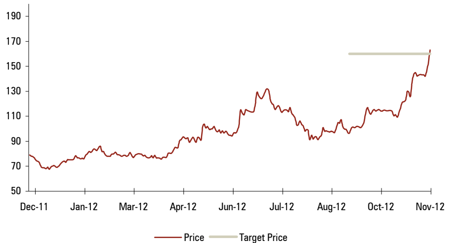
Exhibit 5: Recommendation History

Source: Company, ICICIdirect.com Research